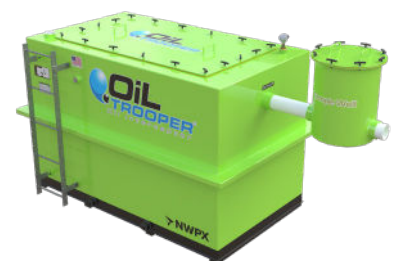
Model SOCMP Oil-Water Separator (Steel)