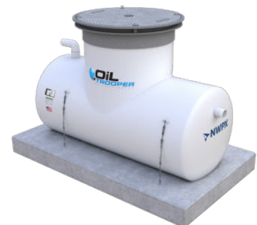
Model AQS Oil-Water Separator (Fiberglass)