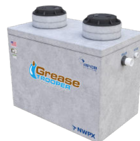
Precast Concrete Model